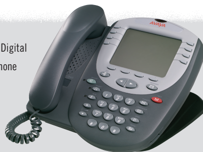
2420 Digital Telephone